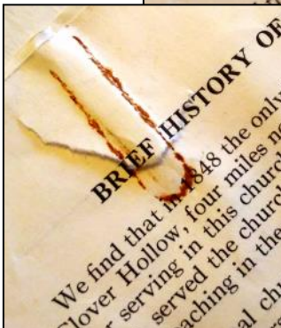
Above: damage caused by standard metal paper clips