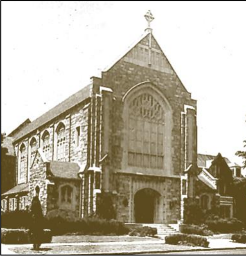
First Lutheran Church, Norfolk, Virginia